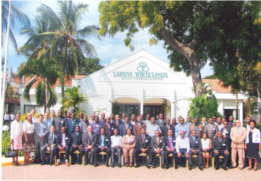
UPDEA - 3rd MEETING OF THE SCIENTIFIC COMMITTEE AT WHITESANDS HOTEL JULY 4-6 2011 MOMBASA KENYA.