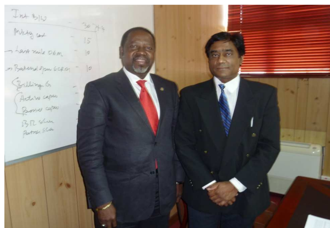
The Secretary General with the Deputy MD of CEB) Mauritius Mr.

The General Secretary is keeping contact with the Deputy Managing Director for that purpose.